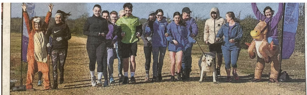
Some of the runners taking part in the fundraiser